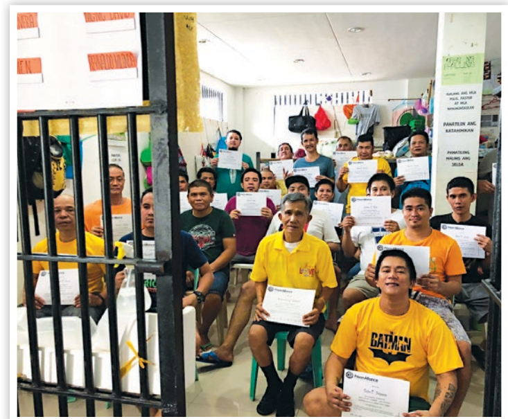
258 inmates in the Philippines receive a Bible after completing their first CLI Bible study.